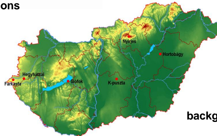
background monitoring and sampling stations