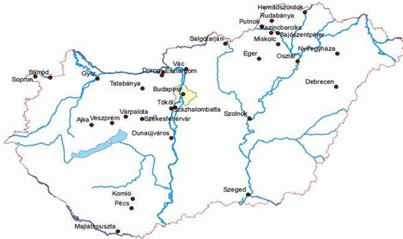
Automata urban monitoring stations